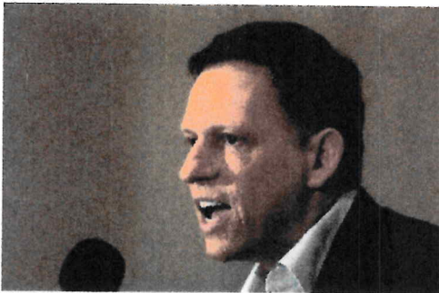
Venture capitalist Peter Thiel, above, secretly financed Hulk Hogan's case against Gawker.com, the ruling on which drove it out of business.

Gawker's lawyers are examining the relationship between Thiel and Hulk Hogan's lawyer