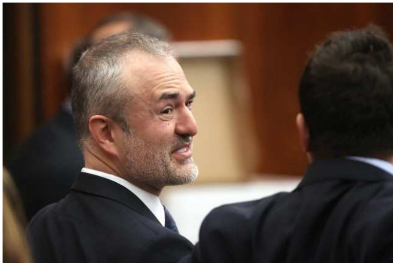
Nick Denton, founder of Gawker, talks with his legal team before Hulk Hogan testifies in court, in St Petersburg, Fla., on March 8, 2016.

A planned sale of Gawker and the continued specter of litigation make the website's articles vulnerable to deletion